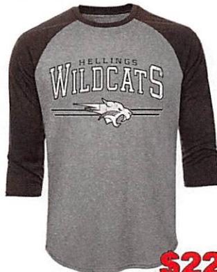
Performance Baseball T